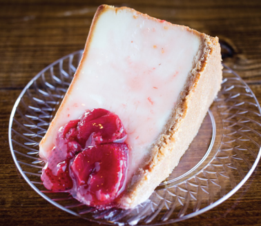
Cheesecake • $4.99 pp