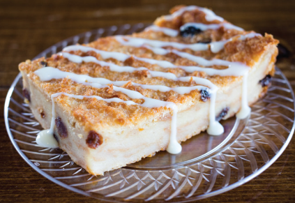
Bread Pudding • $2.99 pp