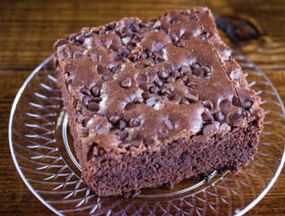
Brownie • $2.99 pp