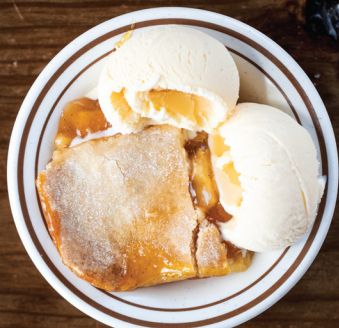
Peach Cobbler • $2.99 pp