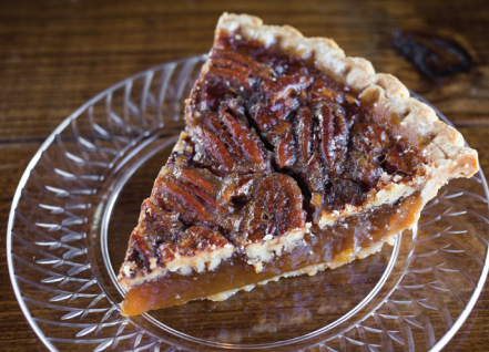
Pecan Pie • $4.99 pp