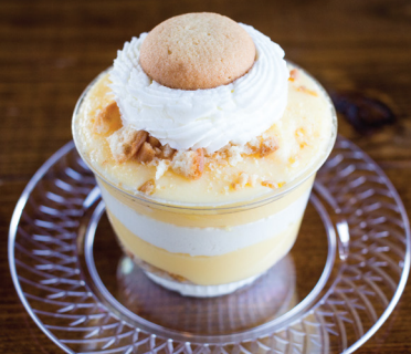
Banana Pudding • $2.99 pp